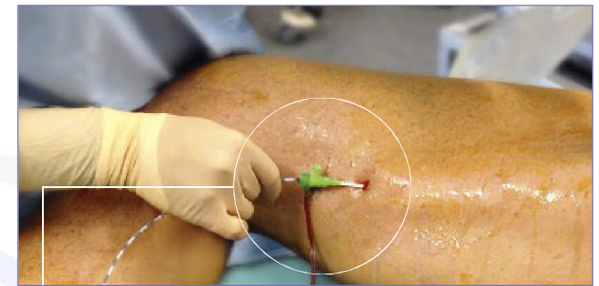
The catheter is inserted painlessly into the leg under local anaesthesia.

signal to the vein wall. This causes the vein to coagulate and eventually disappear.